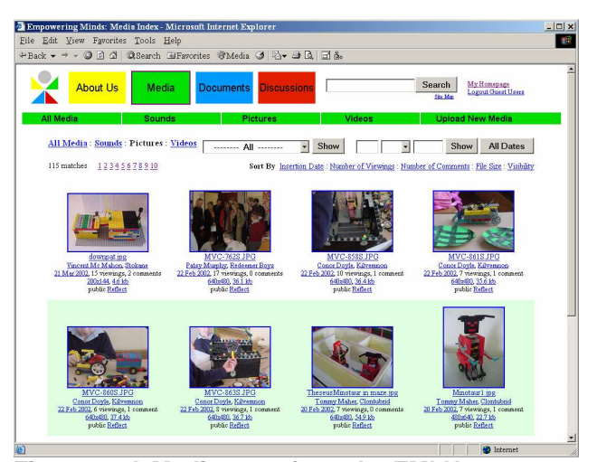
Figure 1. A Media page from the EMLN

Media file is any sound, picture, or video. It is widely observed that students are reluctant to disassemble the Lego creations they have committed much time to inventing. Creating and sharing one's handiwork through Media often helps to alleviate the distress of losing a favorite model. Figure 1 shows one of the pages in the Media section.